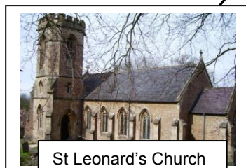
St Leonard's Church