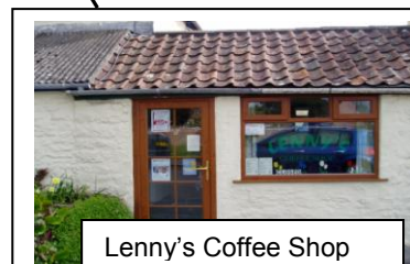
Lenny's Coffee Shop