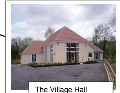
The Village Hall