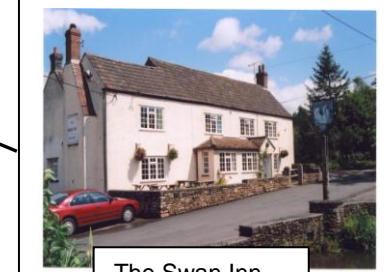
The Swan Inn