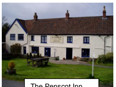
The Penscot Inn