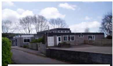
Shipham C of E First School and Shipham Pre-School