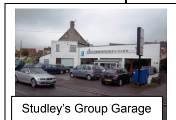
Studley's Group Garage